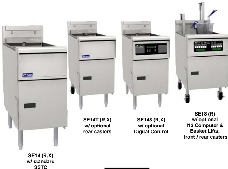
SE14 (R,X) w/ standard SSTC